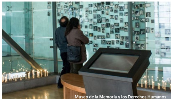
Museo de la Memoria y los Derechos Humanos

Here you have a complementary list of activities for you during your stay.