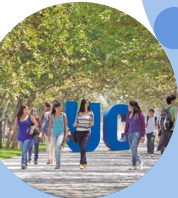
UC Chile Campus